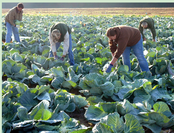
Gleaning cabbage in Georgia