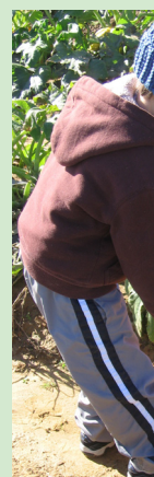
A tiny glean