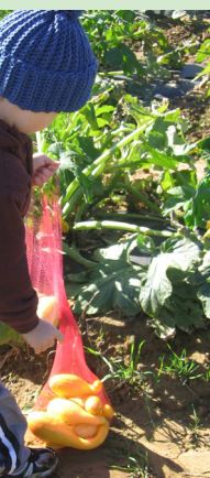
er in Tennessee