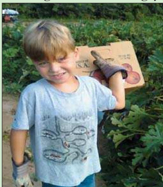
A hard-working gleaner in NC