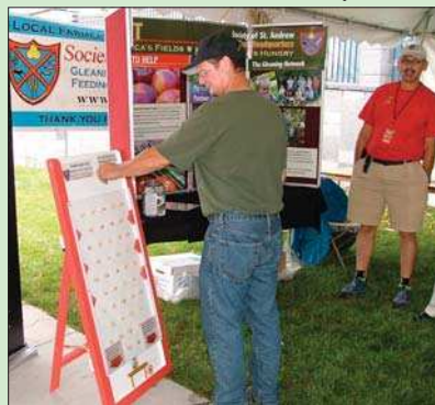
SoSA West at Farm Aid