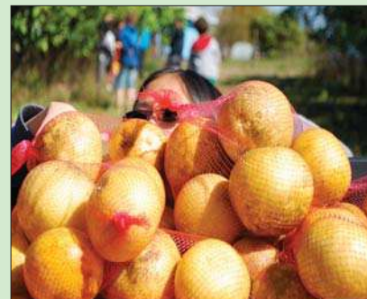
A FL gleaner up to her forehead in citrus