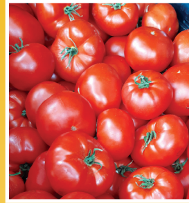
These beautiful red tomatoes were rescued and shared with families in need in Indiana.

We at the Society of St. Andrew and all of our partners in this work—from small farmers to commercial growers, small neighborhood