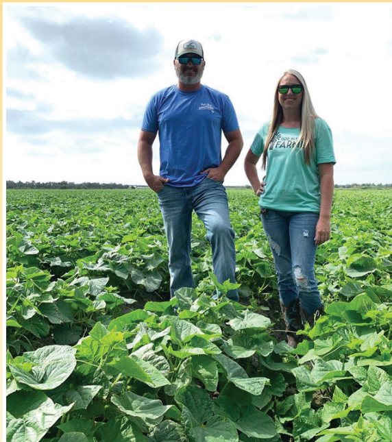
Long & Scott Farms farms sharing how the COVID-19 pandemic has dramatically affected their business and how they are still dedicated to sharing their food with nearby nonprofits.

They work through regular, long-established supply chains. And though those supply chains and processing capacities aren't working at the moment, it could require hundreds of thousands or even millions of dollars for them to re-tool their