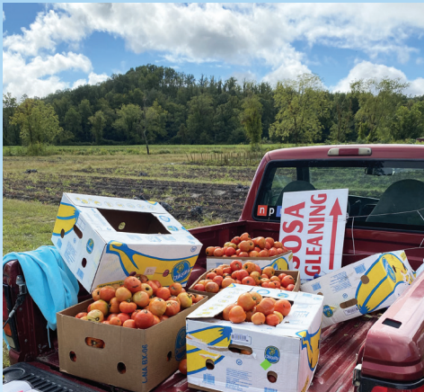
These tomatoes are from North Carolina but no matter where the food comes from, it always ends up on the tables of local families in need.

Every time you served, your efforts demonstrated your passion. We know your time and energy are limited. You also have jobs, families, and personal lives. You have plenty of responsibilities to care for in your own lives. And yet you gladly looked beyond your own needs and served your neighbors.