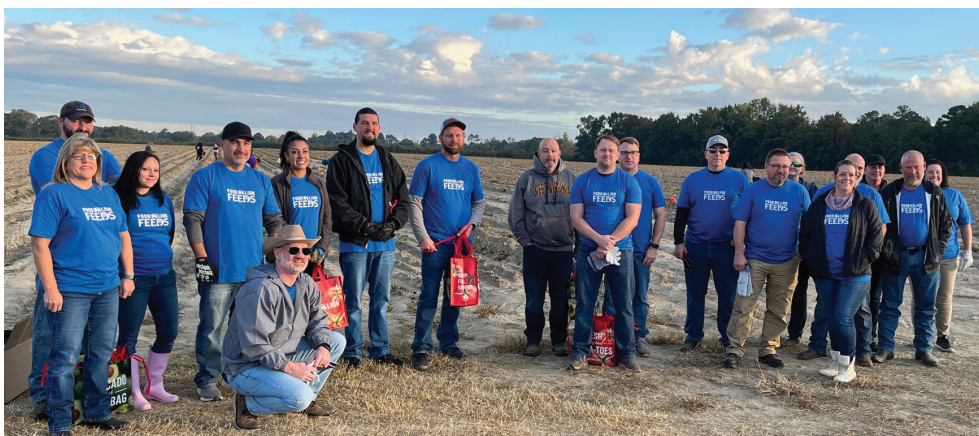
A local grocer/retailer encouraged their employees to glean with SoSA as a way to live out their organizational promise to reduce food waste and be the best neighbor possible in the towns and cities they serve.

Tom knows the secret. Yam Jam is not about who gleanes the most or the fastest. It's a celebration of God's abundance, a harvest festival where people of all ages gather and eagerly do their part. They enjoy the beauty of creation in the crisp fall air, while gathering good food to share with people who need it most. ■