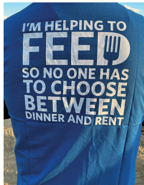
This grocery store employee volunteered at multiple events in 2022 and his shirt explains his motivation, plain and simple, for serving in the mission to end hunger.